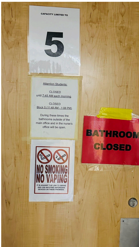
Locked Bathroom door at PHS

This has become a major inconvenience and to some, even dehumanizing. In order to understand viewpoints from multiple different perspectives the principal, security officer, and a student provided their opinion.