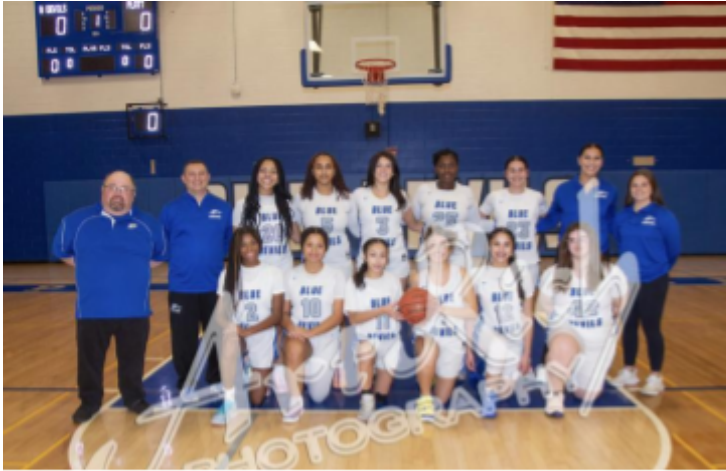
Plainville Girl's Basketball 23-24 Season

Plainville girls basketball makes their way to states for the first time in four years as they take on Platt Tech High School February 26, 2024 to start playoffs. Plainville has shown much improvement and it's clear the work is paying off. As the regular season is coming to an end the girls have faced challenges but were able to overcome them as they advanced into states. Plainville was able to end their season with 8 wins and 12 loses. What makes it more special for the girls is how they