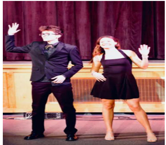
Black Dress Girl, Giola, posing with contestant

All in all, the Mr. PHS show seems to have a great reputation amongst participants. The interviewees can all agree that It's a fun and unique experience for seniors that they should take advantage of and just have a good time while they're still in high school.